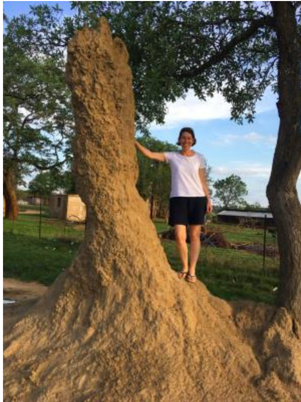
3 - Impressive Macrotermes mounds, South Africa