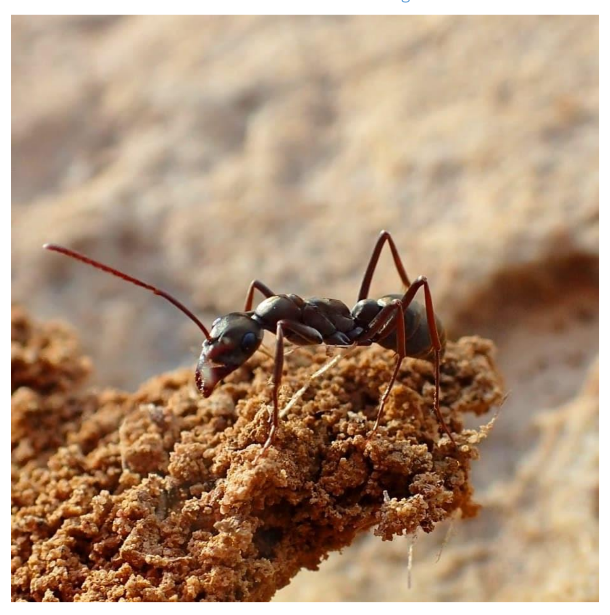
Reminder: EU-IUSSI 2020 will be 22-25th of August 2021