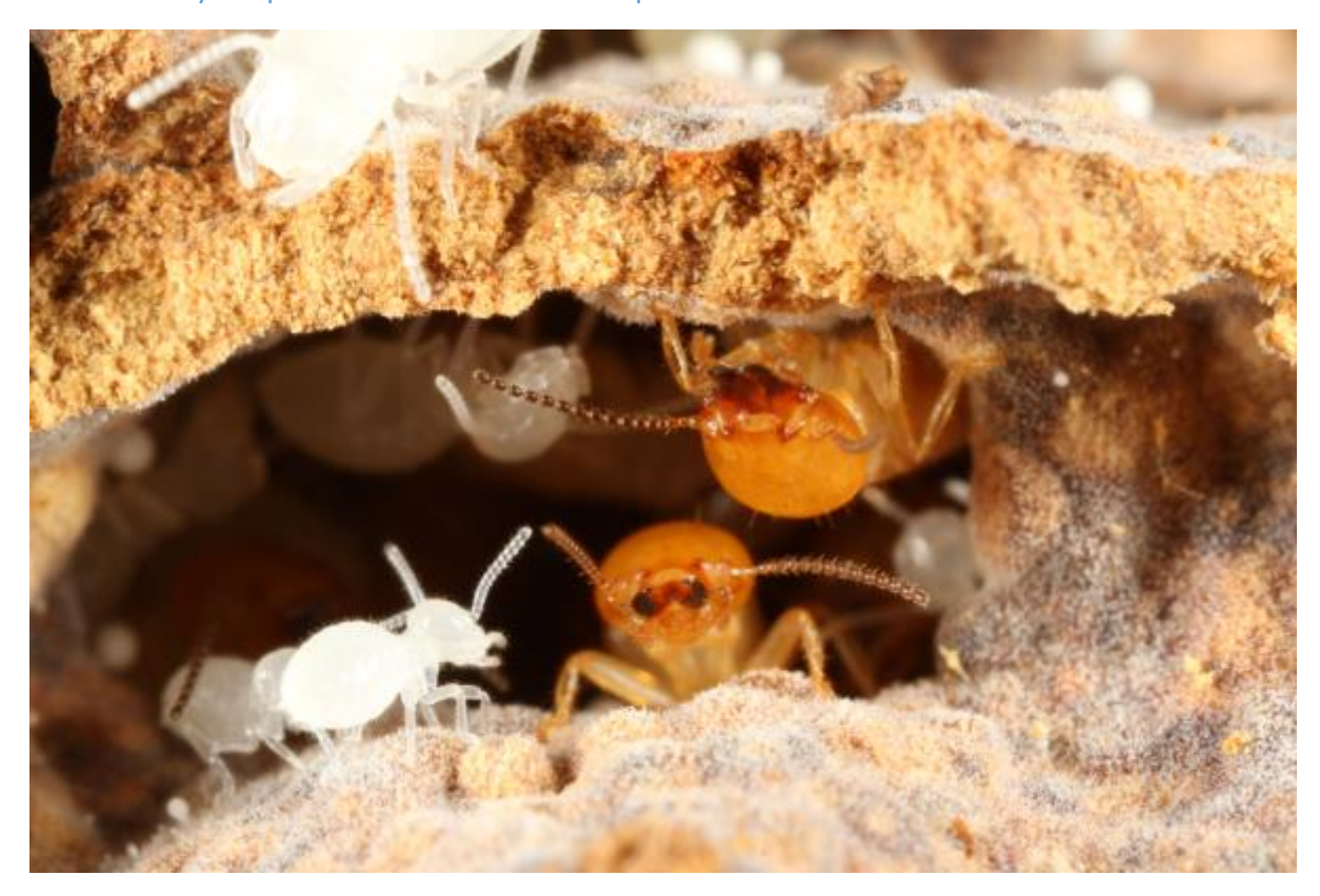
IUSSI Encyclopedia - additional copies

For those wanting to order additional copies of the IUSSI encyclopedia, Springer has advised that they will only organise one copy at a reduced price; any addition copies need to be order via their website here: