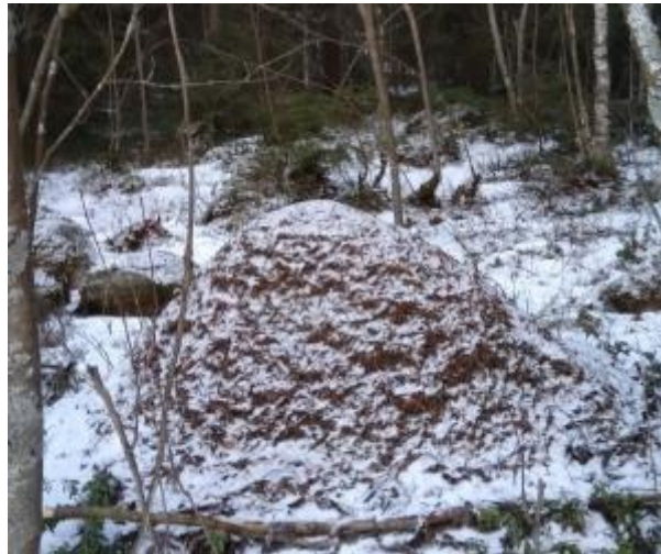
2 - Not quite time for fieldwork yet.