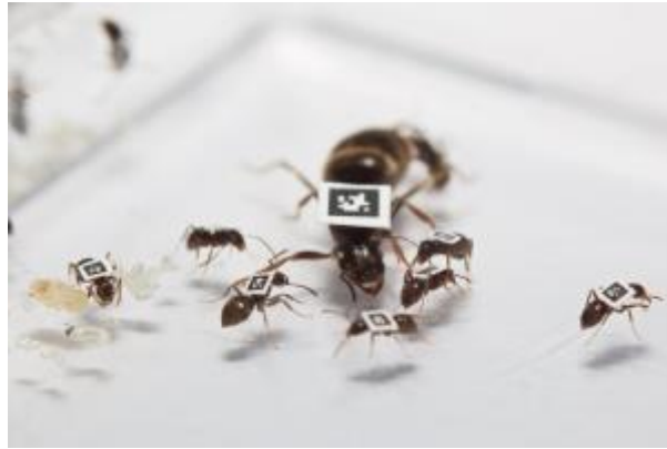
3 - Tagged Lasius ants to be tracked automatically. The tags are so small, conventional printers cannot provide the proper resolution for the QR code!